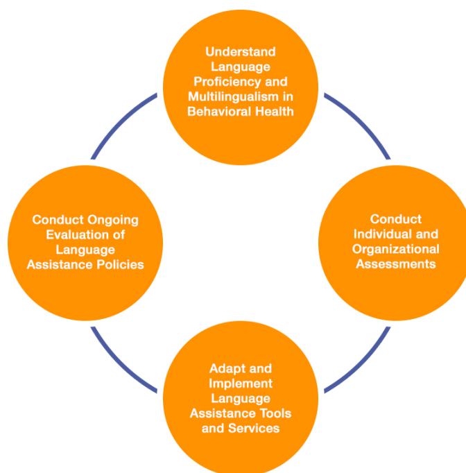
Figure 1: Continuum of Language Assistance Policies and Services